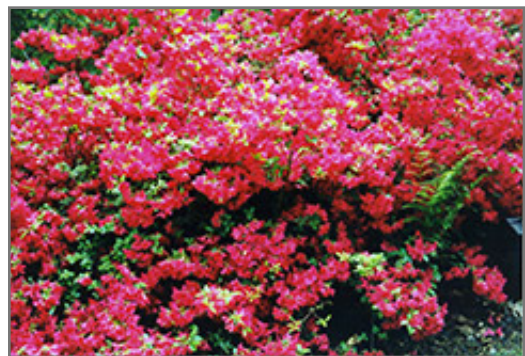
Hino Red Azalea in bloom