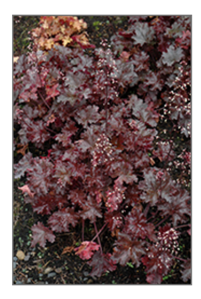
Black Taffeta Coral Bells