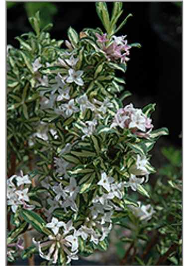
Lunar Eclipse Daphne flowers

Lunar Eclipse Daphne will grow to be about 3 feet tall at maturity, with a spread of 4 feet. It tends to fill out right to the ground and therefore doesn't necessarily require facer plants in front. It grows at a slow rate, and under ideal conditions can be expected to live for approximately 20 years.