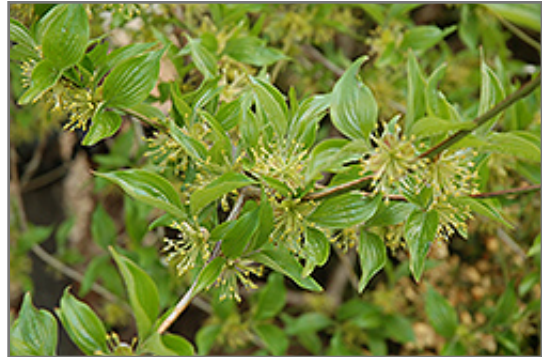
Lemon Zest Japanese Cornelian Dogwood flowers