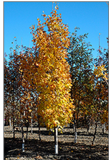
Lord Selkirk Sugar Maple in fall