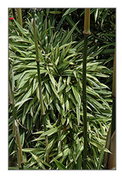
Variegated Chinese Temple Bamboo foliage