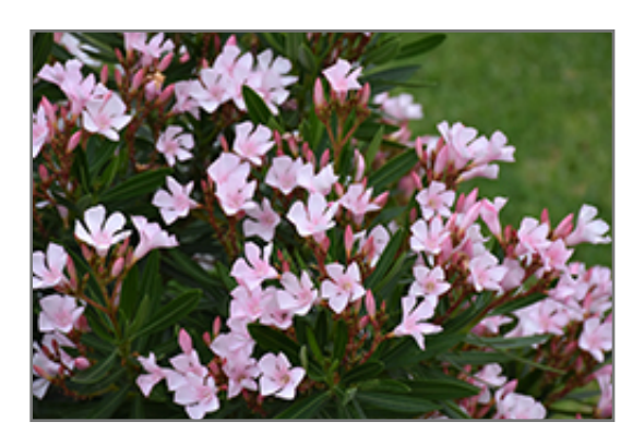
Petite Pink Oleander flowers