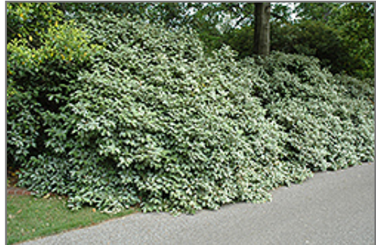
Fruitland Silverberry

Fruitland Silverberry will grow to be about 15 feet tall at maturity, with a spread of 15 feet. It has a low canopy, and is suitable for planting under power lines. It grows at a fast rate, and under ideal conditions can be expected to live for approximately 30 years.