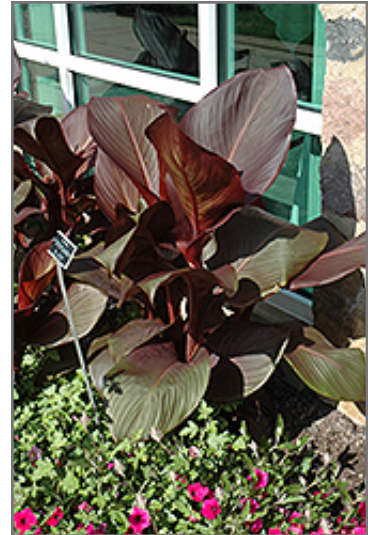
Tropicanna Black Canna

This plant should only be grown in full sunlight. It prefers to grow in moist to wet soil, and will even tolerate some standing water. It is not particular as to soil type or pH. It is highly tolerant of urban pollution and will even thrive in inner city environments. Consider applying a thick mulch around the root zone in winter to protect it in exposed locations or colder microclimates. This particular variety is an interspecific hybrid. It can be propagated by division; however, as a cultivated variety, be aware that it may be subject to certain restrictions or prohibitions on propagation.