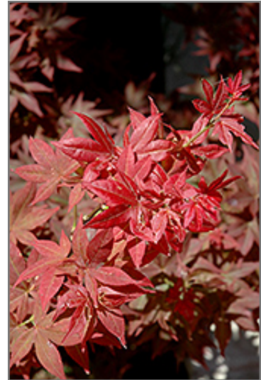
Ruby Stars Japanese Maple foliage