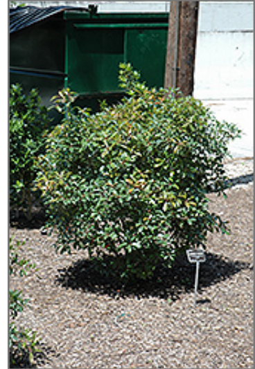
LeAnn Cleyera

LeAnn Cleyera makes a fine choice for the outdoor landscape, but it is also well-suited for use in outdoor pots and containers. Because of its height, it is often used as a 'thriller' in the 'spiller-thriller-filler' container combination; plant it near the center of the pot, surrounded by smaller plants and those that spill over the edges. It is even sizeable enough that it can be grown alone in a suitable container. Note that when grown in a container, it may not perform exactly as indicated on the tag - this is to be expected. Also note that when growing plants in outdoor containers and baskets, they may require more frequent waterings than they would in the yard or garden. Be aware that in our climate, most plants cannot be expected to survive the winter if left in containers outdoors, and this plant is no exception. Contact our experts for more information on how to protect it over the winter months.