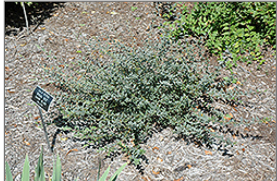
Bridal Rice Creeping Willow