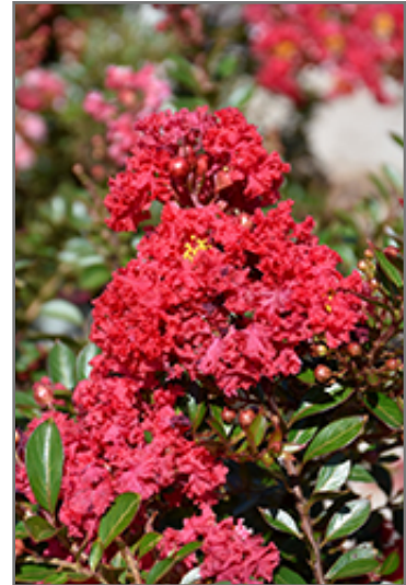
Cherry Dazzle Crapemyrtle flowers

Cherry Dazzle Crapemyrtle is recommended for the following landscape applications;