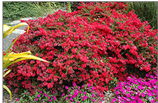
Cherry Dazzle Crapemyrtle in bloom