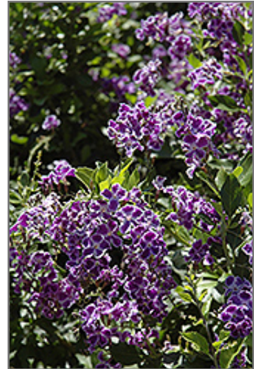
Golden Dewdrop flowers