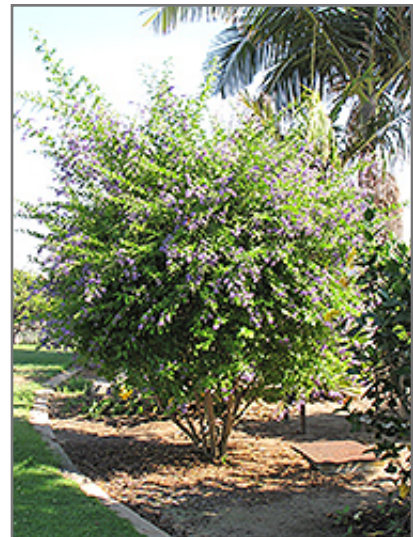
Golden Dewdrop