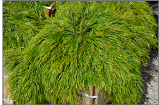
Cousin Itt Little River Wattle