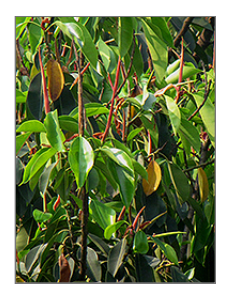
Indian Laurel Fig foliage