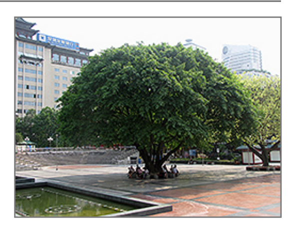
Indian Laurel Fig

This tree does best in full sun to partial shade. It does best in average to evenly moist conditions, but will not tolerate standing water. It is not particular as to soil type or pH, and is able to handle environmental salt. It is highly tolerant of urban pollution and will even thrive in inner city environments. Consider applying a thick mulch around the root zone in winter to protect it in exposed locations or colder microclimates. This species is not originally from North America.