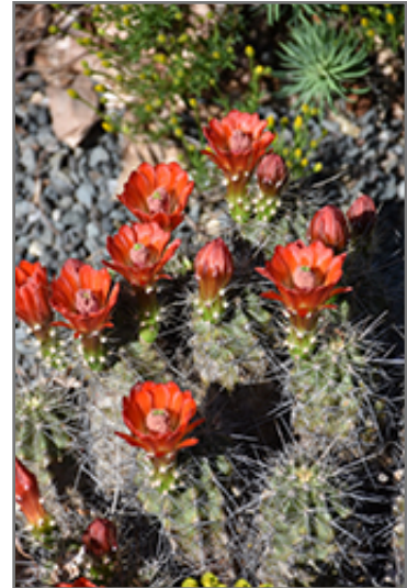
Mexican Claret Cup flowers

Mexican Claret Cup is recommended for the following landscape applications;