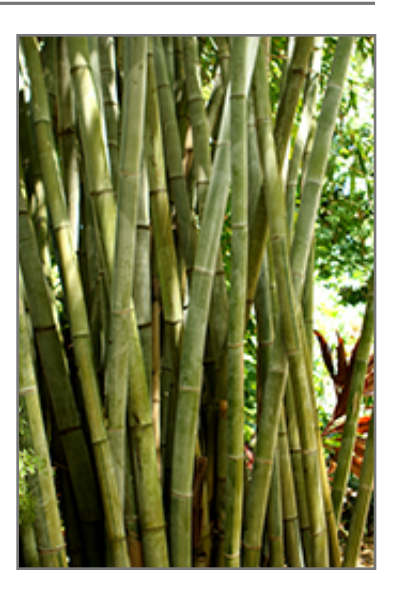
Ghost Bamboo stems