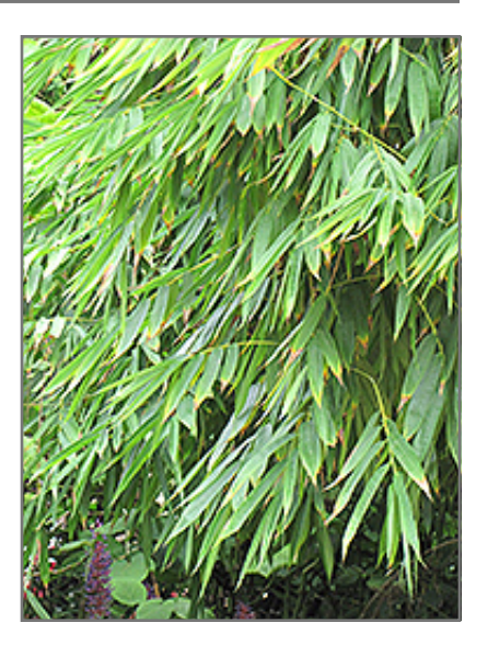
Ghost Bamboo foliage

Ghost Bamboo is a fine choice for the garden, but it is also a good selection for planting in outdoor pots and containers. Because of its height, it is often used as a 'thriller' in the 'spiller-thriller-filler' container combination; plant it near the center of the pot, surrounded by smaller plants and those that spill over the edges. It is even sizeable enough that it can be grown alone in a suitable container. Note that when growing plants in outdoor containers and baskets, they may require more frequent waterings than they would in the yard or garden. Be aware that in our climate, most plants cannot be expected to survive the winter if left in containers outdoors, and this plant is no exception. Contact our experts for more information on how to protect it over the winter months.