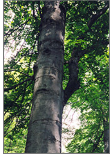
American Beech bark

This tree should only be grown in full sunlight. It requires an evenly moist well-drained soil for optimal growth, but will die in standing water. It is not particular as to soil pH, but grows best in rich soils. It is quite intolerant of urban pollution, therefore inner city or urban streetside plantings are best avoided, and will benefit from being planted in a relatively sheltered location. This species is native to parts of North America.