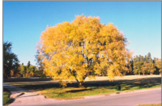
Boxelder in fall