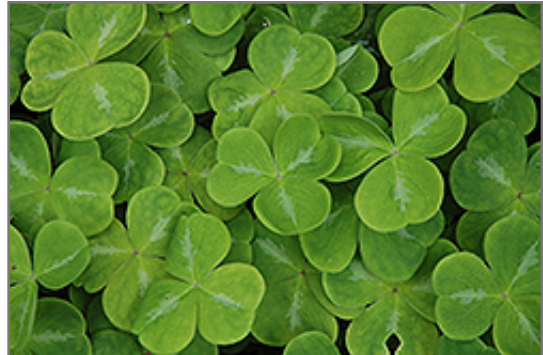
White European Liverleaf foliage