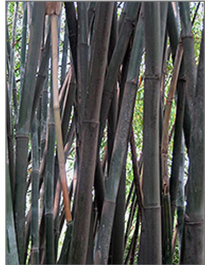
Chinese Goddess Bamboo bark