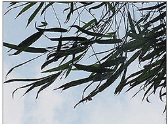
Chinese Goddess Bamboo foliage