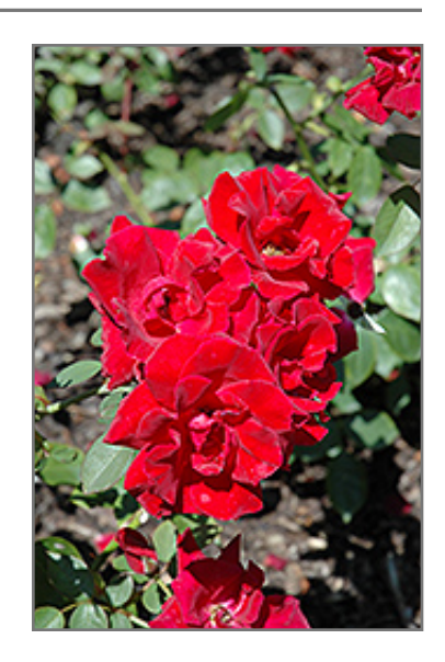
Midwest Living Rose flowers

Midwest Living Rose will grow to be about 3 feet tall at maturity, with a spread of 3 feet. It tends to fill out right to the ground and therefore doesn't necessarily require facer plants in front. It grows at a fast rate, and under ideal conditions can be expected to live for approximately 20 years.