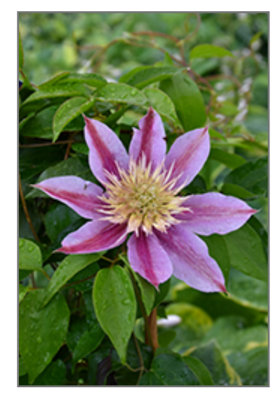
Empress Clematis flowers