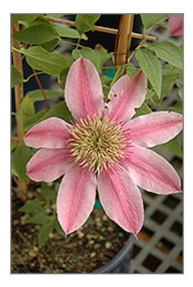
Empress Clematis flowers