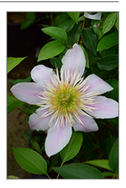
Empress Clematis flowers

Empress Clematis makes a fine choice for the outdoor landscape, but it is also well-suited for use in outdoor pots and containers. Because of its spreading habit of growth, it is ideally suited for use as a 'spiller' in the 'spiller-thriller-filler' container combination; plant it near the edges where it can spill gracefully over the pot. It is even sizeable enough that it can be grown alone in a suitable container. Note that when grown in a container, it may not perform exactly as indicated on the tag - this is to be expected. Also note that when growing plants in outdoor containers and baskets, they may require more frequent waterings than they would in the yard or garden. Be aware that in our climate, most plants cannot be expected to survive the winter if left in containers outdoors, and this plant is no exception. Contact our experts for more information on how to protect it over the winter months.