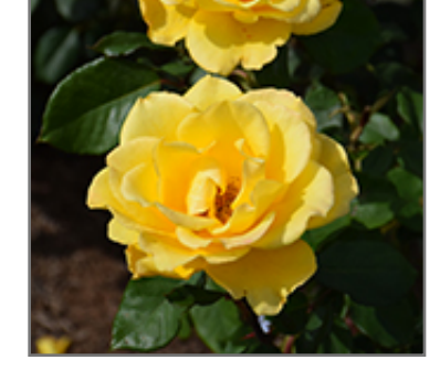
Henry Fonda Rose flowers