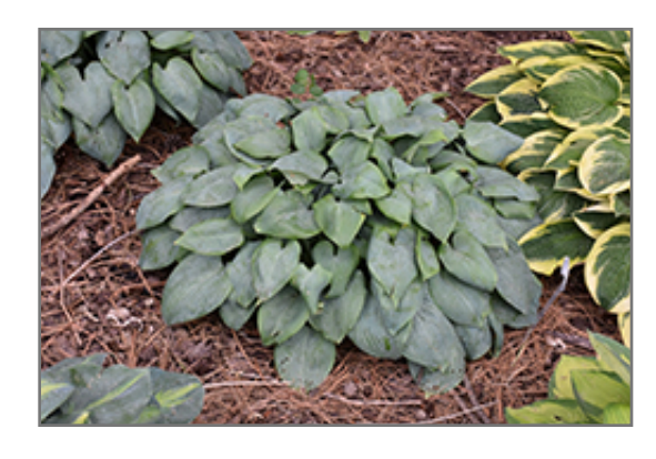
Fragrant Blue Hosta