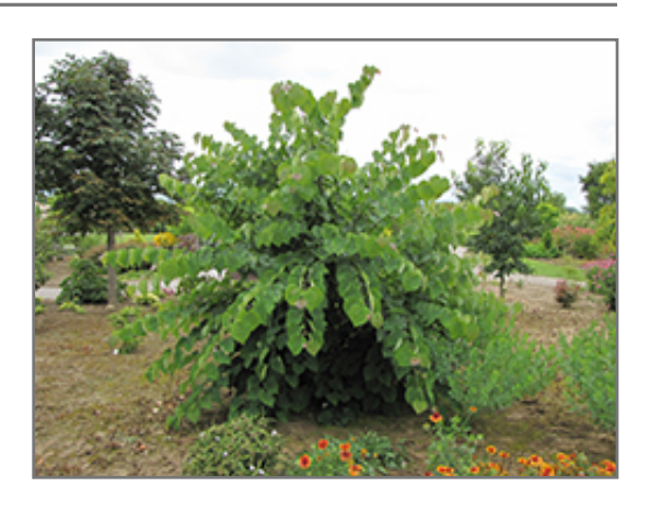
Little Woody Redbud