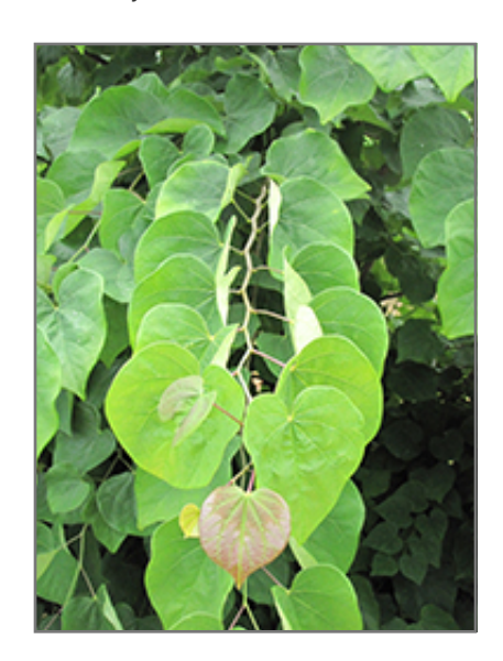
Little Woody Redbud foliage