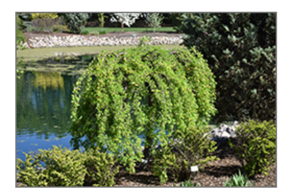
Weeping Peashrub