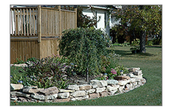
Weeping Peashrub