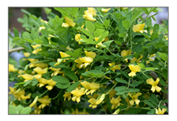
Weeping Peashrub flowers