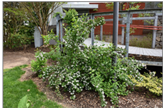
Fragrant Abelia in bloom