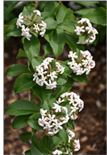
Fragrant Abelia flowers